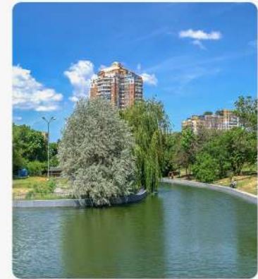
AN ARTIFICIAL LAKE