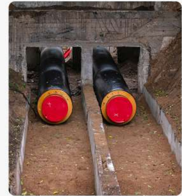
STANDARD DRAINAGE SYSTEM