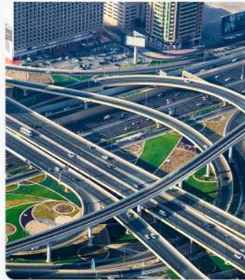
AN INDUSTRIAL-GRADE RIGID ROAD NETWORK