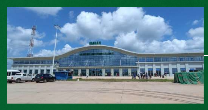
Lagos-Ibadan Train Station