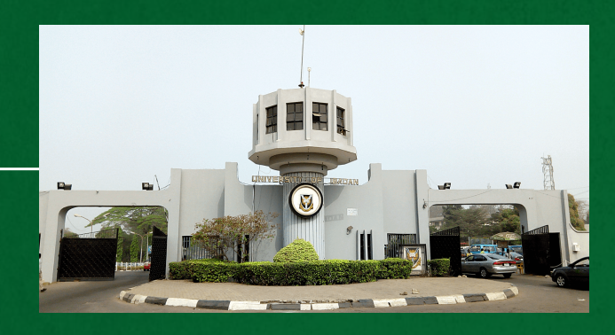
University of Ibadan

The Green Residence offers unmatched connectivity and convenience. Its proximity to these landmarks ensures easy access to educational, transportation, and commercial hubs, enriching your lifestyle and investment potential.