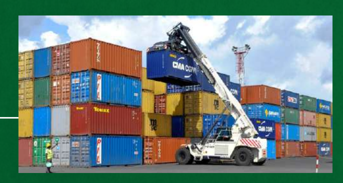
Ibadan Inland Dry Port